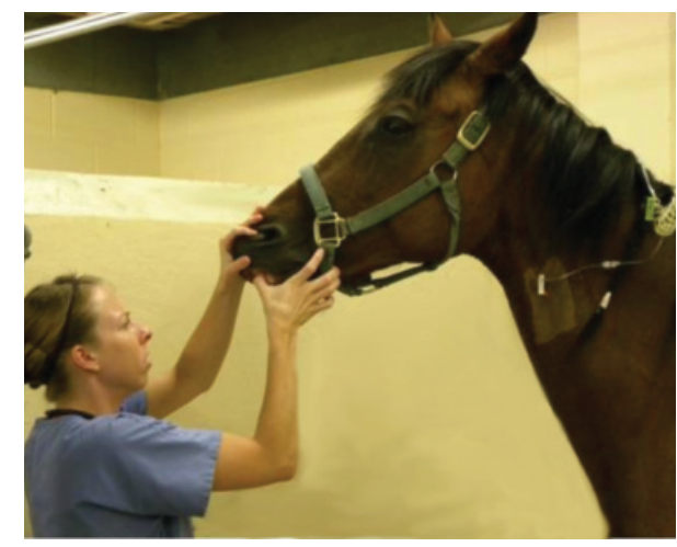
The staff at the University of Pennsylvania conducts an examination for a Grayson funded project

"Veterinarians have a good understanding of how to handle infectious diseases but it's important for everyone to follow basic elements of how not to spread disease," says Smith. "For example, don't use the same rag when wiping horses' mouths, don't use common water sources. Little things make a big difference." Says Haydon: "It's unbelievable how far we've come, but we still have a ways to go."